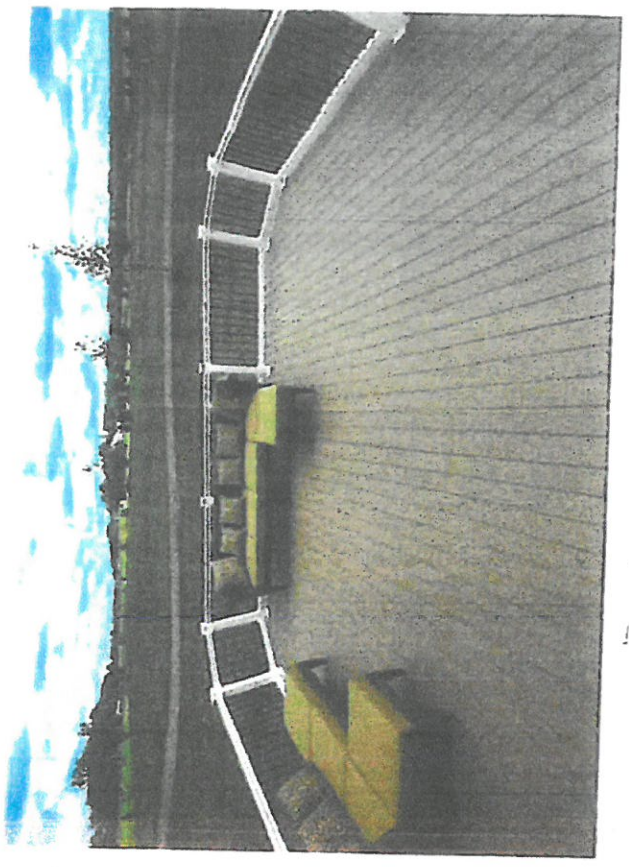
Color Scheme -