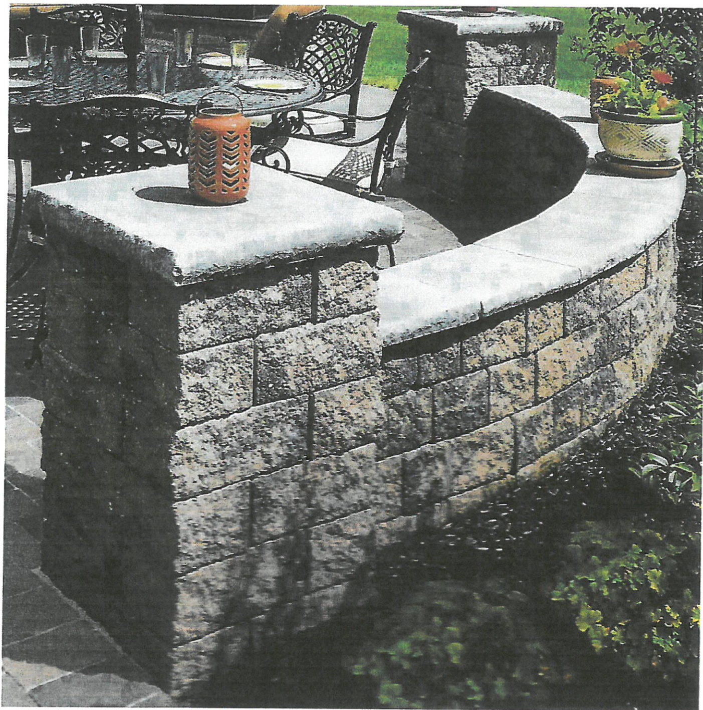
PATIO Color scheme